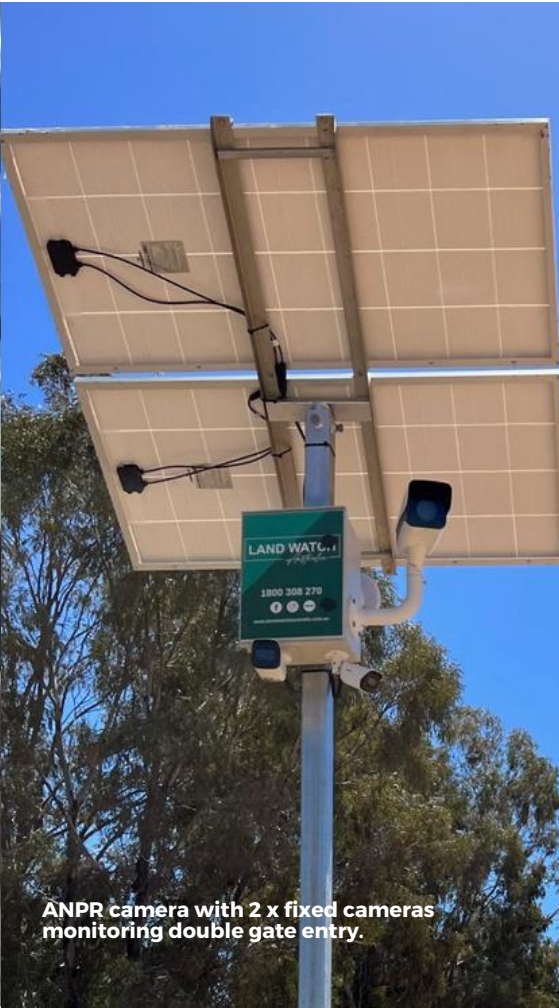
ANPR camera with 2 x fixed cameras monitoring double gate entry.