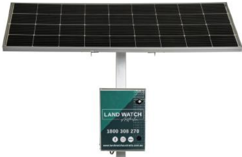
SOLAR POWERED -Optional solar and battery upgrade for low sun areas