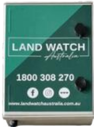
MAINS POWERED -Optional UPS or backup solar