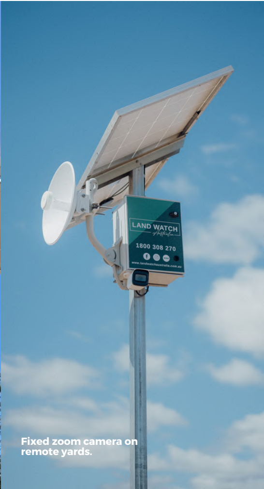
Fixed zoom camera on remote yards.