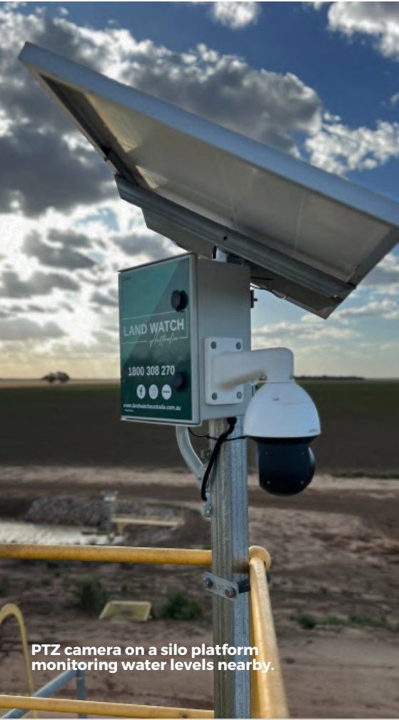
PTZ camera on a silo platform monitoring water levels nearby.

**Infrared night vision appears as black and white.