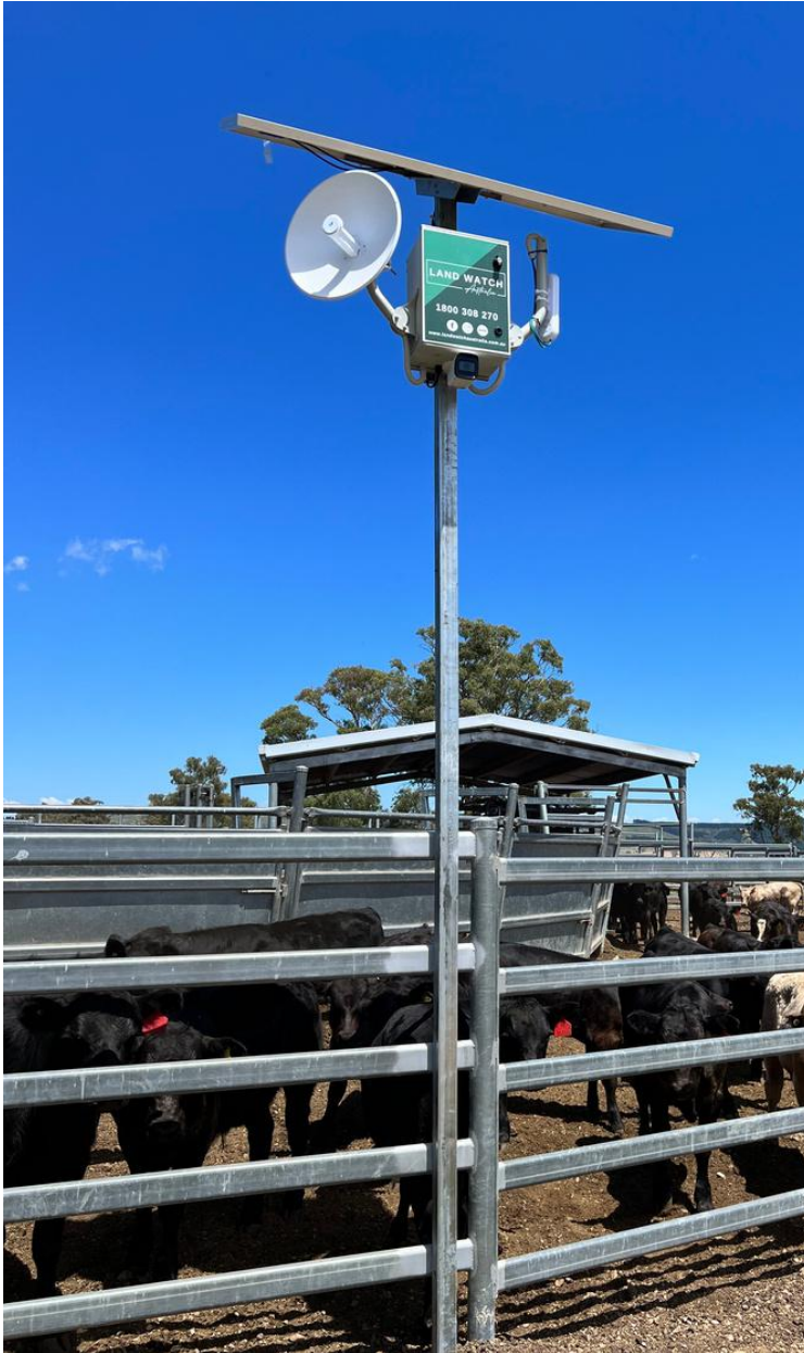
4 kilometer Land Watch Link with repeater, camera and wifi

A Land Watch Link provides a direct network connection between two points. This means we can take the internet from where it is and connect it to where it needs to be – a bit like Wi-Fi but aimed from one point to the next and able to travel 30km before needing a repeater station! That internet may be provided from your router in the house, or from the high point on the property with the best 4G reception. At Land Watch, we have tried and tested the use of this technology in remote harsh outback Australian conditions. From the Flinders Ranges in SA to Far North Queensland and over to WA, Land Watch Links are providing valuable connectivity across properties.